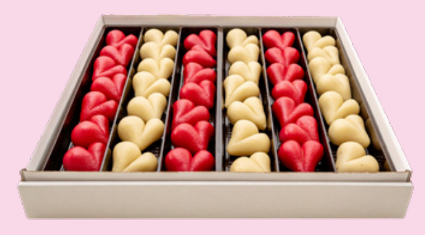
BULK CASE OF MARZIPAN HEARTS Each is 0.88oz. (25g.) (approx. 42pc per case) 2.3lb.