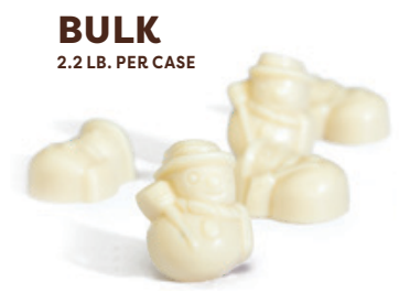
BULK CASE OF SNOWMEN-SHAPED WHITE CHOCOLATES W/praliné filling (approx. 60 pieces) 70011