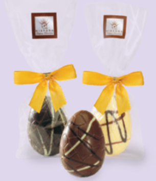
1PC. PICASSO EGG HOLLOW CHOCOLATE FIGURINE in cello bag w/clip, mixed case with dark, milk and white chocolate eggs (3" Tall) 24/case 20620