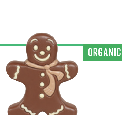
GINGERBREAD MAN HOLLOW MILK CHOCOLATE FIGURINE w/decorations in cello bag (5" Tall), 12/case 68585