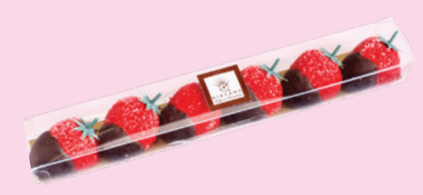
6PC. ALL NATURAL MARZIPAN STRAWBERRIES Dipped in dark chocolate in clear giftbox. 12/case 10190