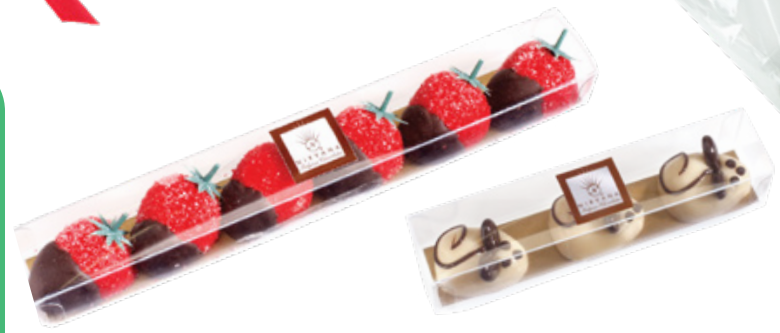
6PC. ALL NATURAL MARZIPAN STRAWBERRIES dipped in dark chocolate, 12/case 10190