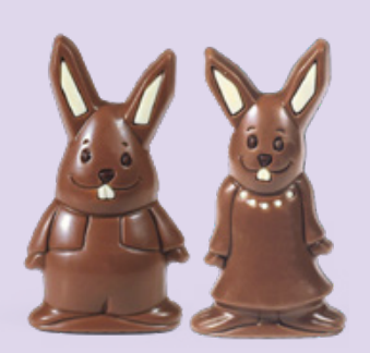
BOY AND GIRL BUNNY in hollow milk chocolate w/white accents in cello bag (mixed case of 6 of each) (5" Tall) 12/case 20685