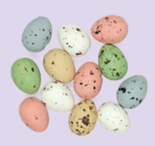
NATURAL PASTEL COLORED SPECKLED EGGS w/praliné filling in bulk case (loose) (Approx. 72pc.) 21142