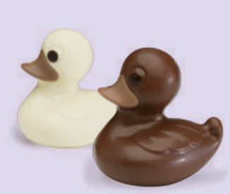
RUBBER DUCK WHITE AND MILK HOLLOW CHOCOLATE FIGURINE in cello bag w/ clip (2 1/2" Tall) (mixed case of milk and white chocolate) 24/case