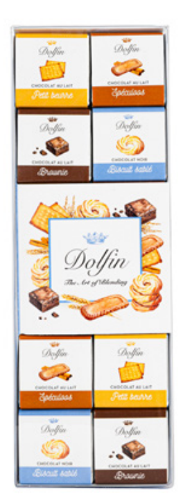
24 PC. BISCUIT MIX Assorted chocolate squares, 3.8oz.,15/case D3104