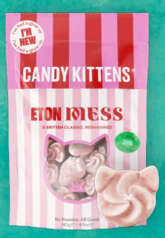
ETON MESS CK1000712