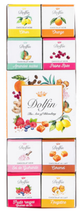
24 PC. PANACHE Asstd chocolate squares, 3.8oz.,15/case D8041