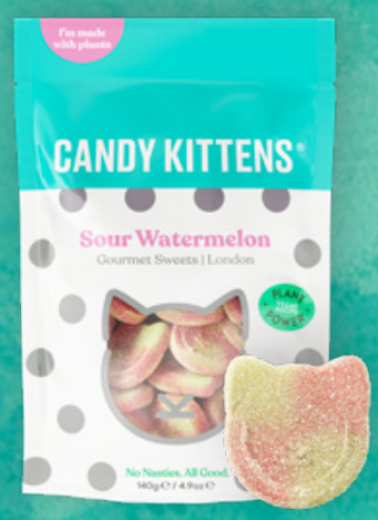
SOUR WATERMELON CK1000598