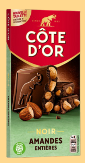
DARK CHOCOLATE WITH WHOLE ALMONDS CD16720