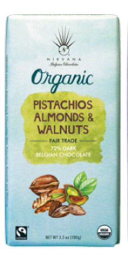
PISTACHIOS, ALMONDS & WALNUTS 72% Dark Belgian Chocolate 589