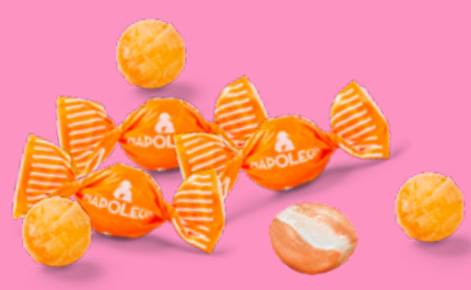
ORANGE SOURS NAP3000033