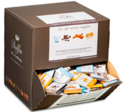
MIX OF MILK NEOPOLITANS: Milk, Coffee, Cinnamon, Nougatine D8072