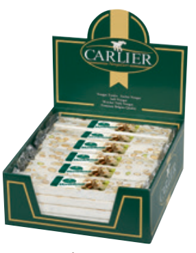
PURE MONTÉLIMAR NOUGAT with almonds in display 5.29oz. (150g.) x24 CAR5416