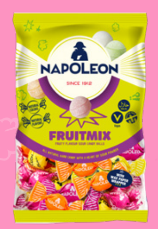
FRUIT MIX SOURS (Lemon, lime, Cherry, Tangerine, Pinapple) All Natural 150wwg. NAP111