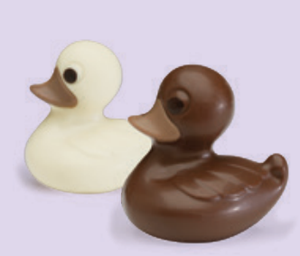
RUBBER DUCK WHITE AND MILK HOLLOW CHOCOLATE FIGURINE in cello bag w/ clip (2 1/2" Tall) (mixed case of milk and white chocolate) 24/case