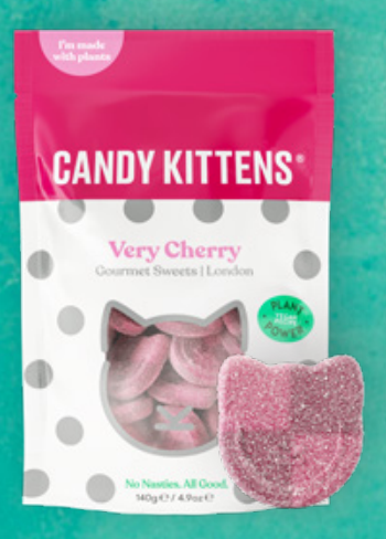
VERY CHERRY CK1000601