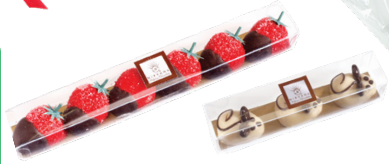
6PC. ALL NATURAL MARZIPAN STRAWBERRIES dipped in dark chocolate, 12/case 10190