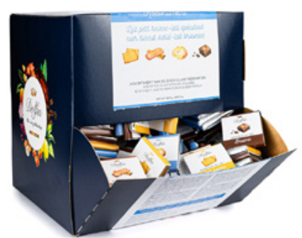
MIX OF COOKIE NEOPOLITANS: Dark Shortbread; Milk Speculoos, Milk, Brownie, Milk Butter Cookie 03105