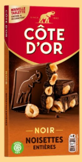
DARK CHOCOLATE WITH WHOLE HAZELNUTS