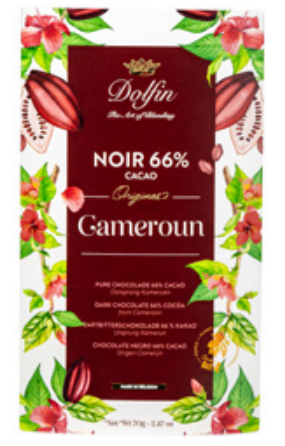
DARK 66% CAMEROON D5059