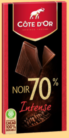
DARK (70% COCOA) CD16755