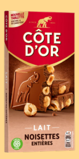
MILK CHOCOLATE WITH WHOLE HAZELNUTS CD17042