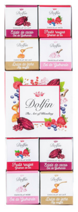
24 PC. SUGAR & SALT Assorted chocolate squares, 3.8oz.,15/case D8043