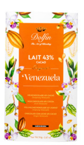
MILK 43% VENEZUELA D5056

Our expert chocolatiers discovered this bean in the region of the Mekong delta, in Vietnam's highlands. Its delicate marriage of caramel and coffee flavours, uplifted with hint of roasted cocoa beans, brings a touch of mystery andrichness to this 45% cocoa milk chocolate. (no lecithin)