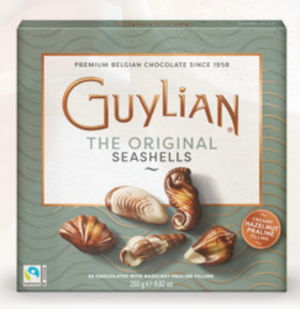
22-PIECE 8.8oz. (250g.) 12/case GL214