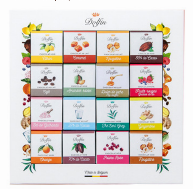
48 PC. PANACHE Asstd chocolate squares, 7.6oz.,10/case D8054