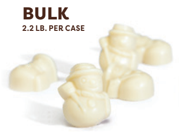
BULK CASE OF SNOWMEN-SHAPED WHITE CHOCOLATES w/praliné filling (approx. 60 pieces) 70011