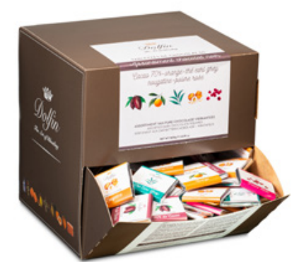
MIX OF DARK NEOPOLITANS: Pure 70%, Nougatine, Orange, Pink Peppercorn and Earl Grey Tea

BULK BOX: 4.08LB. (1.85KG.) APPROX. 350 SQUARES IN BOX