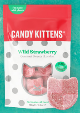
WILD STRAWBERRY CK1000599