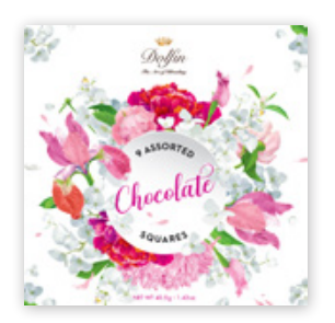
FLOWERS 9-PIECE ASSORTED Milk/Dark gift-box,15/case D2551