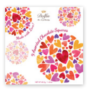
LOVE 9-PIECE ASSORTED Milk/Dark gift-box, 15/case D2550