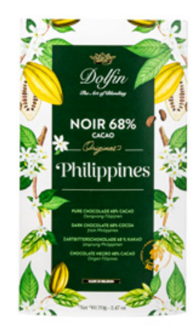
DARK 68% PHILIPPINES D5058

The archipelago of thousands of islands, presents this majestic chocolate that reveals a floral yet fruity, aromatic power. Explore the epitome of the Philippines with this 68% cocoa, dark chocolate, featuring a delicious mix of fruitiness with dominant flavours of tropical fruits such pineapple, banana and passion fruit, complemented with red berries and dried fruit. The flavour profile is then enhanced further with fresh herbaceous and floral notes, as well as a subtle hint of pepper. (no lecithin)