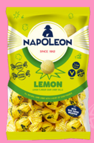
LEMPUR (LEMON) SOURS All Natural 150g. NAP122