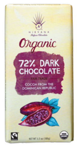
72% DARK CHOCOLATE Fair Trade Cocoa from Dominican Republic 581