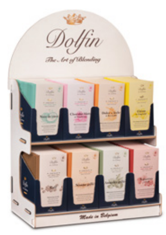
DLARGEWOODENDISPLAY Empty Display Holds 120 Bars or 8 Cases