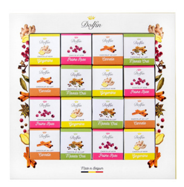
48 PC. SPICES Asstd chocolate squares, 7.6oz.,10/case D8055