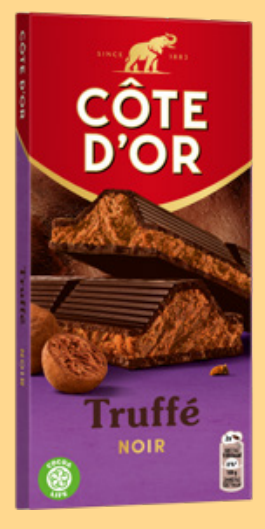
DARK CHOCOLATE WITH DARK TRUFFLE FILLING CD81742