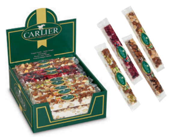
ASSORTED DELUXE NOUGAT BARS IN DISPLAY 3.50z., x27 Individually flow-packed nougat bars/display; ASSORTMENT: 9x Almonds/Hazelnut; 6x berries; 6x chocolate; 6x pistachio CAR5401