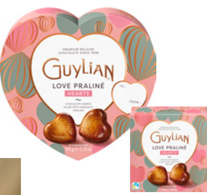
4-PIECE PRALINÉ HEART BOX 1.48oz. (42g.) 24/case (2 x 12 tray) GL902

10-PC PRALINE HEARTS Heart shaped box 3.6oz. (105g.) 6/case GL904