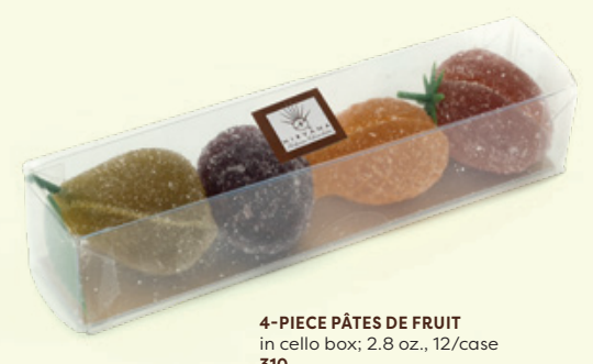
in cello box; 2.8 oz., 12/case 310