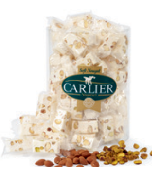
VANILLA, ALMOND, PISTACHIO, HONEY NOUGAT CAR5402