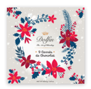
WINTER FLOWER 9-PIECE ASSORTED Milk/Dark gift-box, 15/case D2666