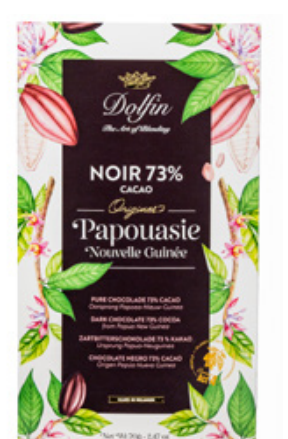
DARK 73% NEW GUINEA D5060