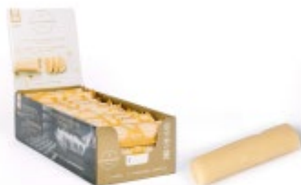
Pure marzipan flow-packed loaf 3.5 oz. (100 gr.) 30/case L110024