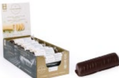
Dark Chocolate enrobed pure marzipan flow-packed loaf 3.5 oz. (100 gr.) 24/case L114024