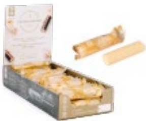
Pure marzipan flow-packed loaf 1.41 oz. (40 gr.) 24/case L110025