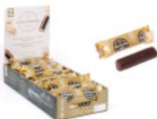
Dark Chocolate enrobed pure marzipan flow-packed loaf 1.41 oz. (40 gr.) 24/case L114028