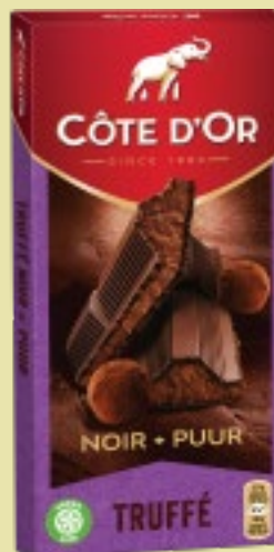
Dark Chocolate with Dark Truffle filling CD81742

6.7oz. (190 g.) truffle filled x 15/case