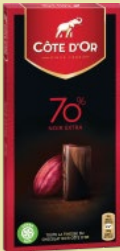
Dark (70% cocoa) CD16755