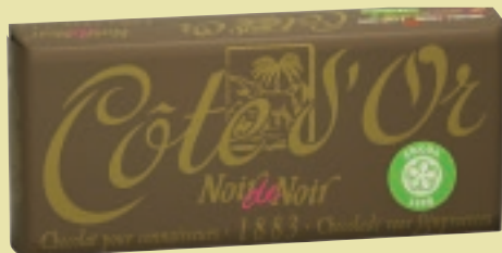
Noir de Noir, (54% cocoa) Dark Chocolate CD23136