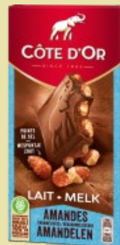
Milk Chocolate with Caramelized Almonds CD21157