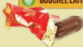
Bouchée, Milk Chocolate w praliné filling, 8pc. Gift Box, 7oz. (200g.) x 12/case CD32595