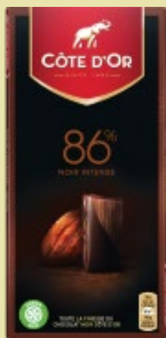
Extra Dark (86% cocoa) CD16800