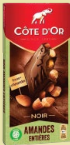
Dark Chocolate with Whole Almonds CD16720