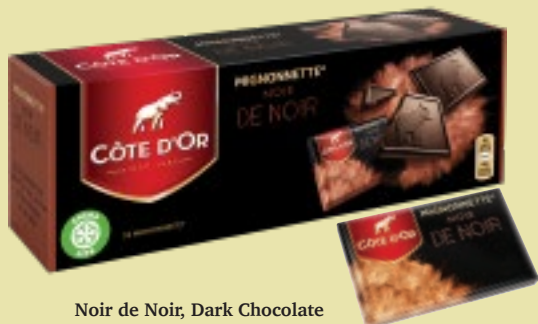
Noir de Noir, Dark Chocolate (54% cocoa) CD17009