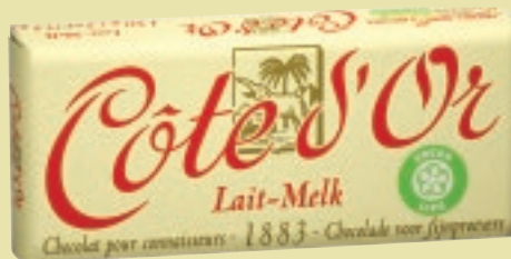
Milk Chocolate CD28178