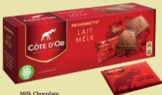
Milk Chocolate CD16938

Côte d'Or mignonnettes, 8.4oz. (240G.) x 12/case