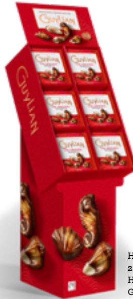
Holiday Seashells 22-piece gift boxes in RED Holiday Sleeve; 48 box DISPLAY GL414