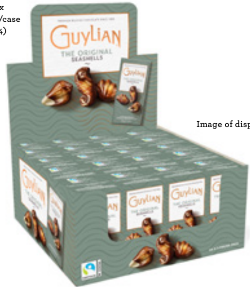
Image of display 33g.