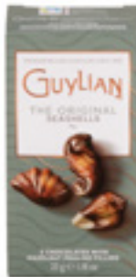
3-piece mini box 33g./1.16 oz. 96/case (4 displays of 24) 96/units GL223