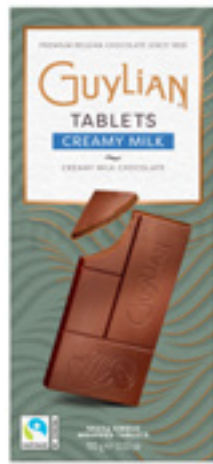
Creamy Milk 100g/3.53oz GL828