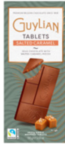
Salted Caramel 100g/3.53oz GL840