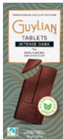
Chocolate Tablet 4 x (12 x 100g) Dark 84% with sweeteners from Stevia GL856

Explore Guylian tablets with reduced sugar content, using stevia-based sweeteners, with an outstanding quality. The 4x 0.88oz. individually wrapped 'No Sugar Added' tablets allow sugar-conscious chocolate lovers to enjoy premium Belgian milk chocolate anytime and anyplace. The new mini tablets are perfect for self-indulgence and portion control or even for those with special dietary needs. 12/case