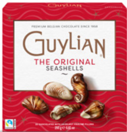
Holiday Seashells 22-piece 250g/8.8 oz. case of 12/case with RED Holiday Sleeve GL314

Share the happiness, enjoy the indulgence with our Guylian Giftboxes. For those special moments during the year, Guylian has a wide assortment of chocolate boxes to offer your beloved ones Christmas or Valentine we have the right box for every occasion.