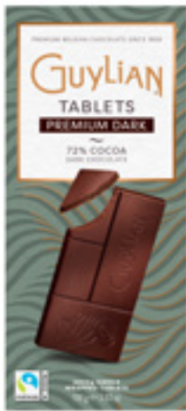
Dark 72% 100g/3.53oz GL826

100g: sugar based portion pack 0.88oz. (25 gram): luxury tablets for self indulgence for all Tablets: 12/case