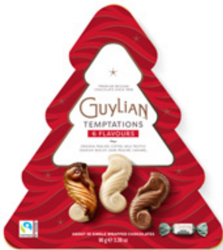
Holiday Guylian's Temptations Mix 10-piece Assortment RED Holiday Tree Pack. 96g/ 3.39 oz. 12/case GL637