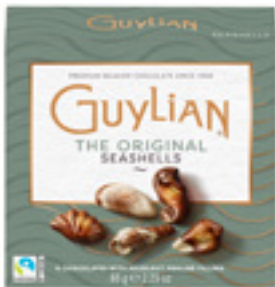
6-piece 65g/ 2.29oz. 24/case GL296

Our Seashells are Guylian’s icons. World famous for their shapes and known as THE ORIGINAL. The distinctive shininess, the mix of marbled white, dark and milk chocolate and the diverse forms make every seashell unique. All Seashells are filled with our blend of our inhouse roasted delicious hazelnut praline.