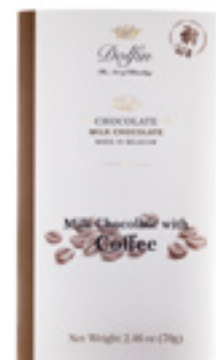
Milk w/ Coffee D8034