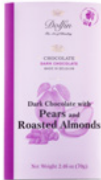
Dark w/ Pear and Roasted Almonds D8022