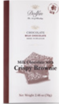
Milk w/ Crispy Brownie D8030