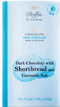
Dark w/ Shortbread and Sea Salt D8029