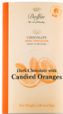
Dark w/ Orange Peel D8014