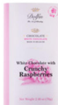
White Chocolate with Raspberries D8033