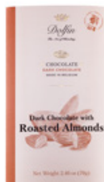
Dark w/ Roasted Almonds D8010