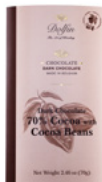
Dark w/ Cocoa Beans (70%) D8007