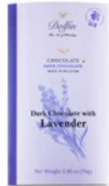
Dark w/ Lavender D8021