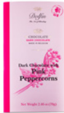
Dark w/ Pink Peppercorn D8015