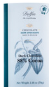
Extra Dark (88%) D8009