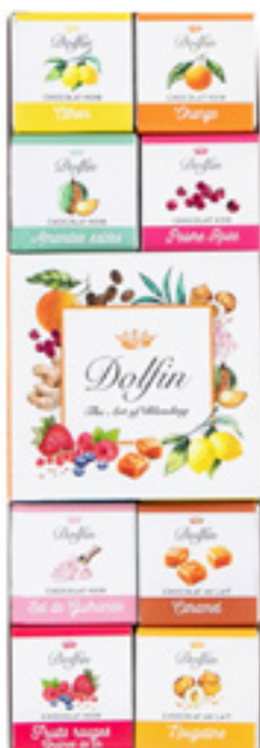
24 pc. PANACHE Assorted chocolate squares, 3.8oz.,15/ case D8041