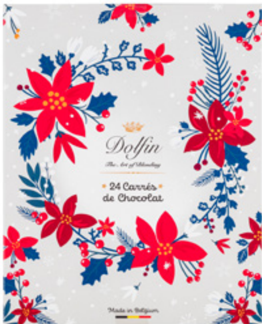
Dolfin Winter flower Milk/Dark Chocolate Assortment: 24 piece gift box, 10/ case D2541