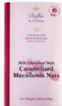
Milk w/ Caramelized Macadamia Nuts D8028