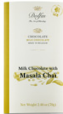
Milk w/ Masala Chai D8017