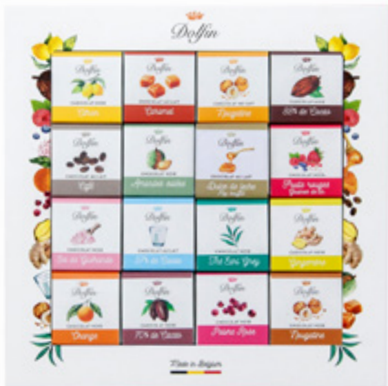
48 pc. PANACHE Assorted chocolate squares, 7.6oz.,10/ case D8054