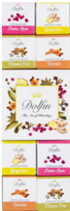
24 pc. SPICES Assorted chocolate squares, 3.8oz.,15/ case D8042