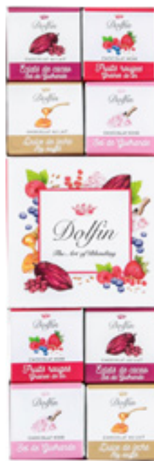
24 pc. SUGAR & SALT Assorted chocolate squares, 3.8oz.,15/ case D8043