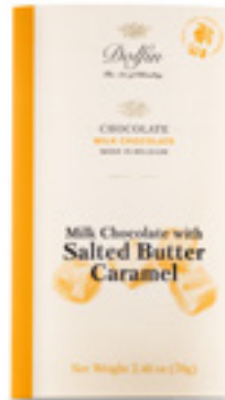
Milk w/ Caramel and Salted Butter D8024