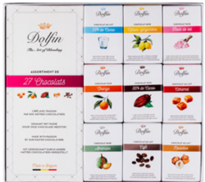
Gift Box w/ 27 Bars 0.35oz. (10g). (9 assorted flavors); 9.5oz. (270g.), 10/case D8800