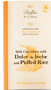
Milk w/ Dulce de Leche and Crispy Rice D8027