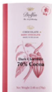
Extra Dark (70%) D8006