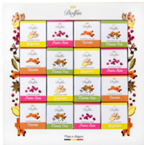
48 pc. SPICES Assorted chocolate squares, 7.6oz.,10/ case D8055