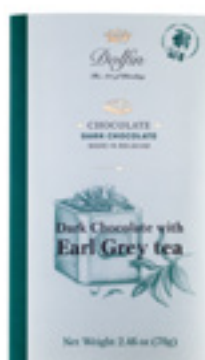
Dark w/ Earl Grey Tea D8011