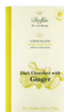
Dark w/ Fresh Ginger D8013