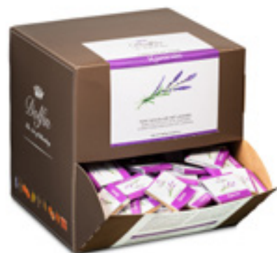
Dark Chocolate with Lavender D1218