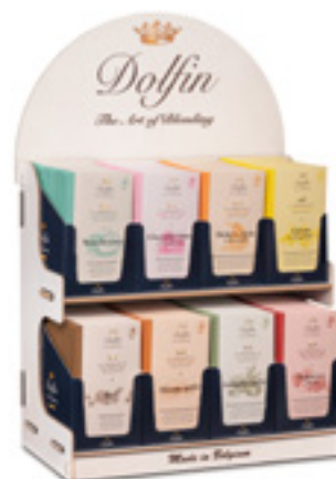
Dlargewoodendisplay Empty Display Holds 120 Bars or 8 Cases

Dolfin's philosophy has revolved around "The Art of Blending." Innovation lies at the heart of the Dolfin spirit, which is why some of the recipes are true gourmet inventions. Each bar is a unique creation of surprising blends of natural, high quality ingredients like fruits, spices and herbs mixed with fine Belgian chocolate to produce flavors that are exquisite and full.