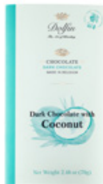
Dark w/ Coconut D8032