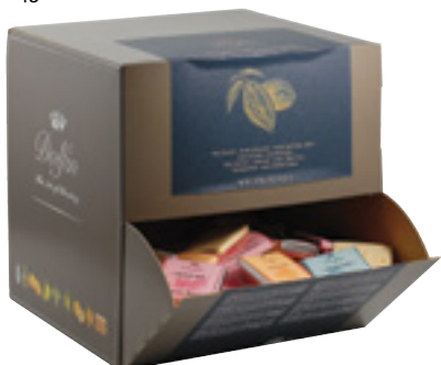
Mix of Dark Neopolitans: Pure 70%, Nougatine, Orange, Pink Peppercorn and Earl Grey Tea D8069