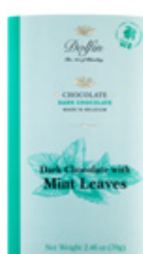
Dark w/ Mint Leaves D8012