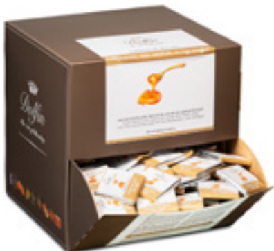
Milk Chocolate with Dulce de Leche Caramel D2452

Bulk Box: 4.08lb. (1.85kg.) approx. 350 squares in box