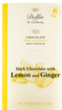
Dark w/ Lemon-Ginger D8031

CO 2 Neutral company, we reduce and offset in-house emissions