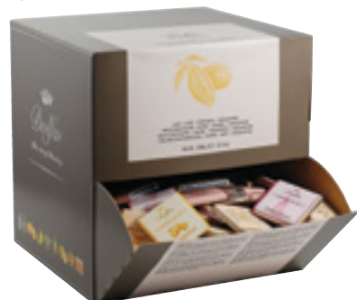
Mix of Milk Neopolitans: Milk, Coffee, Cinnamon, Nougatine D8072