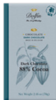
Extra Dark (88%) D8009