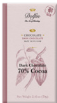
Extra Dark (70%) D8006