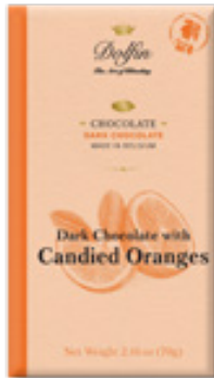
Dark w/ Orange Peel D8014