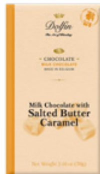
Milk w/ Caramel and Salted Butter D8024