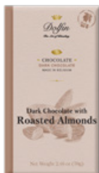
Dark w/ Roasted Almonds D8010