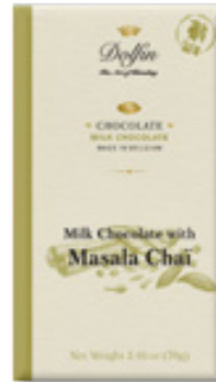
Milk w/ Masala Chai D8017