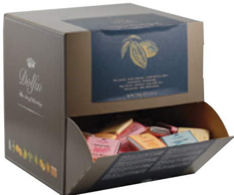
Mix of Dark Neopolitans: Pure 70%, Nougatine, Orange, Pink Peppercorn and Earl Grey Tea D8069

Bulk Box: 4.08lb. (1.85kg.) approx. 350 squares in box