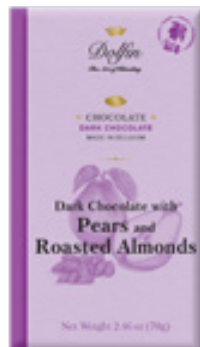
Dark w/ Pear and Roasted Almonds D8022