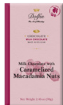
Milk w/ Caramelized Macadamia Nuts D8028