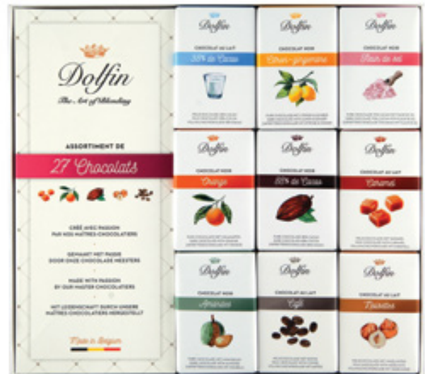
Gift Box w/ 27 Bars 0.35oz. (10g). (9 assorted flavors); 9.5oz. (270g.), 10/case D8800