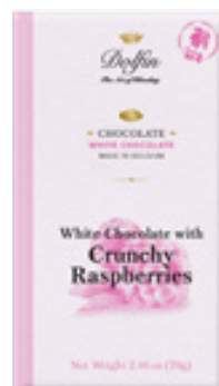
White Chocolate with Raspberries D8033