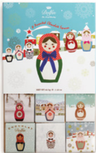
Winter Edition Nesting Dolls Milk/dark assortments- 9-piece 25 units / case D2444