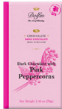
Dark w/ Pink Peppercorn D8015