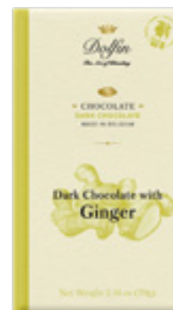
Dark w/ Fresh Ginger D8013