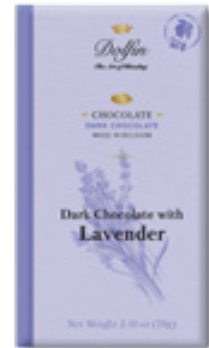
Dark w/ Lavender D8021