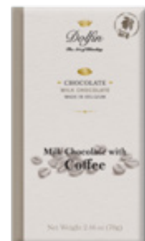
Milk w/ Coffee D8034