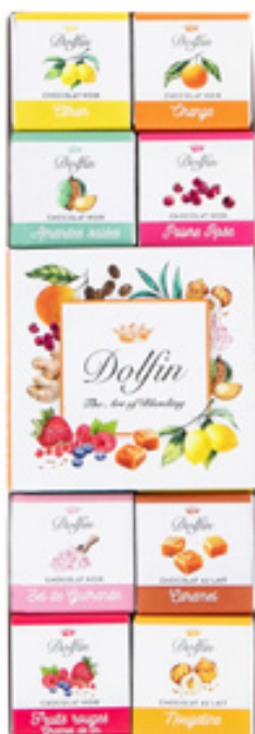
24 pc. PANACHE Asstd chocolate squares, 3.8oz.,15/ case D8041