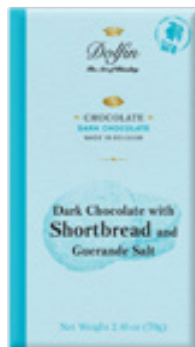
Dark w/ Shortbread and Sea Salt D8029