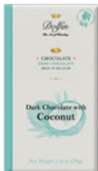
Dark w/ Coconut D8032