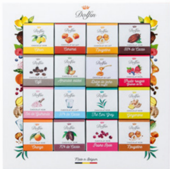
48 pc. PANACHE Asstd chocolate squares, 7.6oz.,10/ case D8054