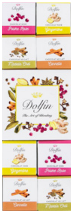
24 pc. SPICES Assorted chocolate squares, 3.8oz.,15/ case D8042