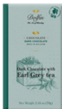
Dark w/ Earl Grey Tea D8011