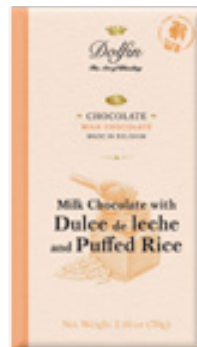
Milk w/ Dulce de Leche and Crispy Rice D8027