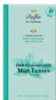
Dark w/ Mint Leaves D8012