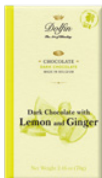
Dark w/ Lemon-Ginger D8031

CO2 Neutral company, we reduce and offset in-house emissions