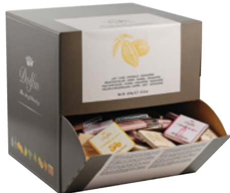
Mix of Milk Neopolitans: Milk, Coffee, Cinnamon, Nougatine D8072