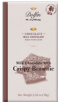
Milk w/ Crispy Brownie D8030