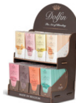
Dlargewoodendisplay Empty Display Holds 120 Bars or 8 Cases

Dolfin's philosophy has revolved around "The Art of Blending." Innovation lies at the heart of the Dolfin spirit, which is why some of the recipes are true gourmet inventions. Each bar is a unique creation of surprising blends of natural, high quality ingredients like fruits, spices and herbs mixed with fine Belgian chocolate to produce flavors that are exquisite and full.