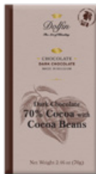
Dark w/ Cocoa Beans (70%) D8007