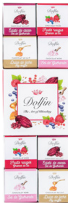
24 pc. SUGAR & SALT Assorted chocolate squares, 3.8oz.,15/ case D8043