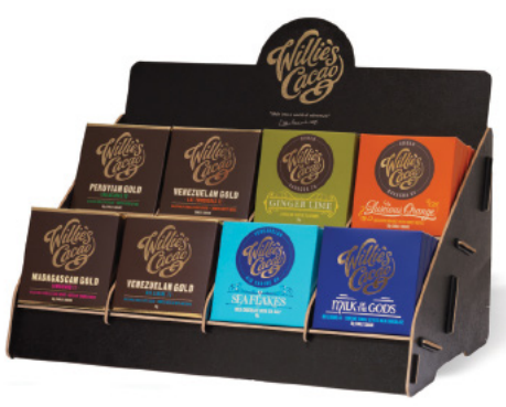
4x2 Premium empty wooden display stand holding 6 bars of each flavor. WC08DS