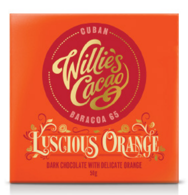
Luscious orange Baracoa 65 dark chocolate with delicate orange WC279