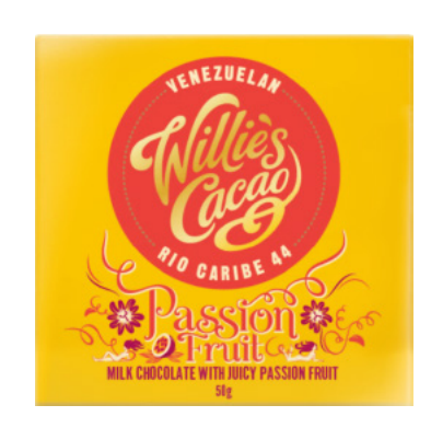
Passion Fruit Milk chocolate with juicy passion fruit WC624