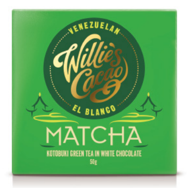
Matcha Ceremonial grade green tea in creamy white chocolate WC693