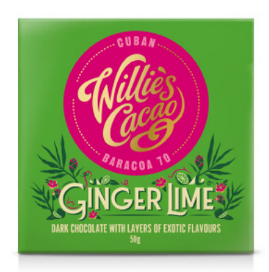
Ginger Lime Dark chocolate with layers of exotic flavours WC293