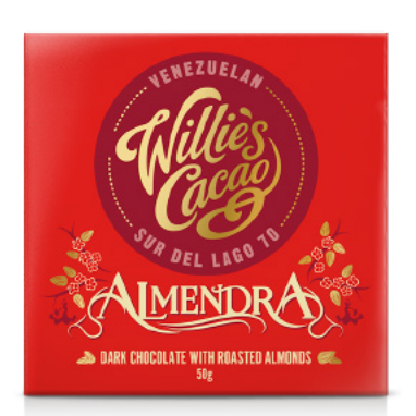
Almendra Dark chocolate with roasted almonds WC386