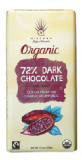
Fair Trade 72% Dark Chocolate 581