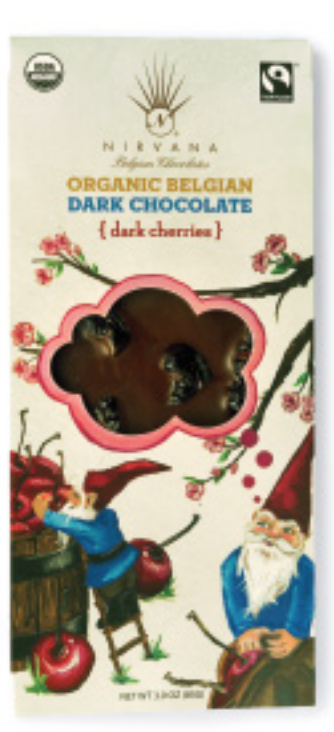
Dark Chocolate with Dark Cherries 571