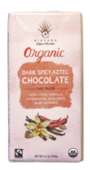
Dark Spicy Aztec Chocolate bar w/Chili, Vanilla, Cinnamon, Almonds and Nutmeg 585