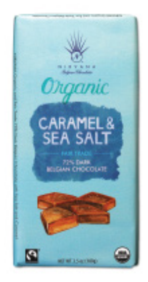
72% Dark Chocolate w/Sea Salt & Caramel 586