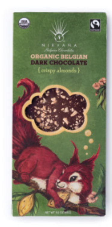
Dark Chocolate with Crispy Almonds 573