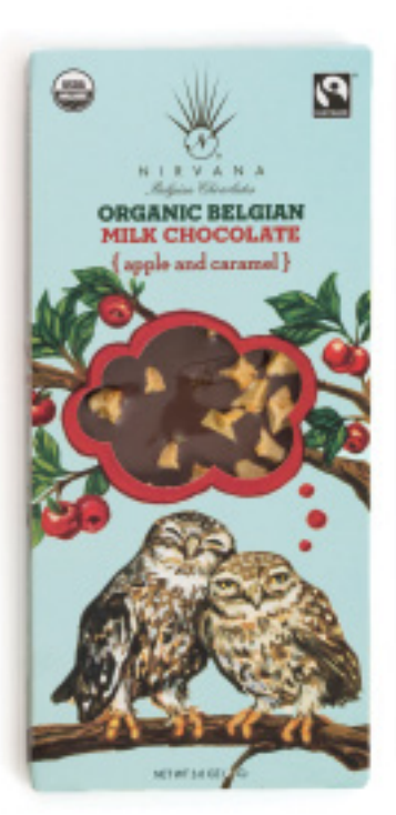
Milk Chocolate with Dried Apple & Caramel 575