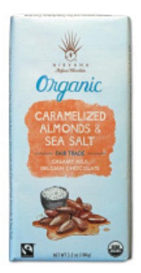
Creamy Milk Belgian Chocolate w/Caramelized Almonds & Sea Salt 593