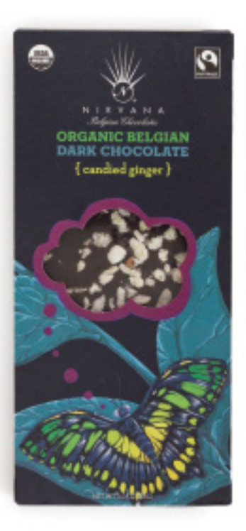
Dark Chocolate with Candied Ginger 574