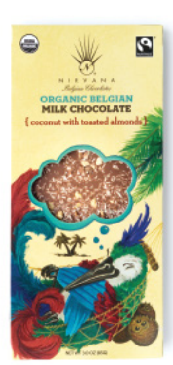
Milk Chocolate with Coconut & Toasted Almond 570