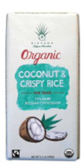
72% Dark Chocolate with Crispy Rice & Coconut 591