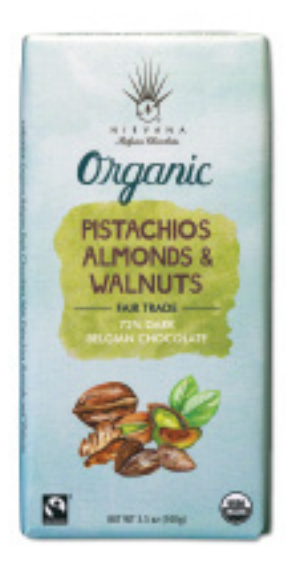
72% Dark Chocolate with Pistachios, Almonds & Walnuts 589