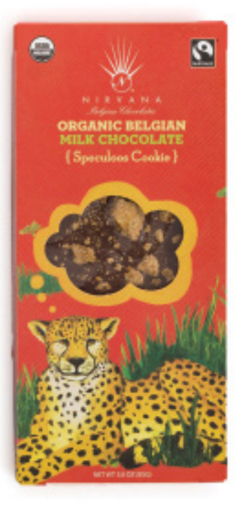
Milk Chocolate with Speculoos Cookie 576