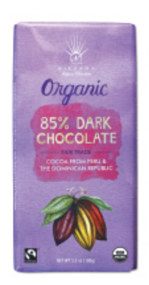
85% Dark Chocolate from Peru & the Dominican Republic 592