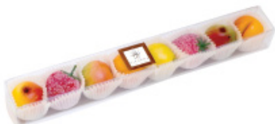
8-pc. small assorted fruit marzipan pieces in cello box; 4.23 oz., 12/case 948