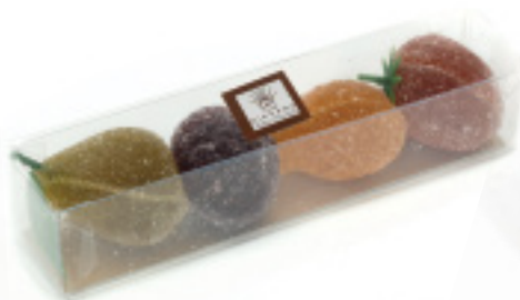
4-piece Pâtes de Fruit in cello box; 2.8 oz., 12/case 310