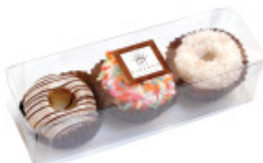
3-pc. Marzipan Donut in cello box; 3 oz., 12/case 985