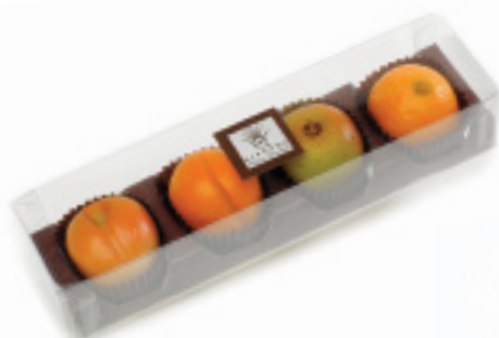
4pc. Assorted marzipan fruit in clear giftbox (assortment of apples, peach and orange), 3.5 oz., 12/case 940