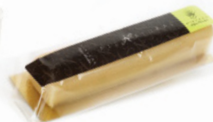
White Marzipan Bar in clear flow pack, 5.2 oz., 12/case 960