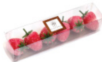
6-pc. mini strawberry marzipan fruit in cello box; 1.94 oz., 10/case 936