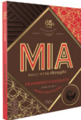
Cranberry & Hazelnut 65% dark chocolate M006