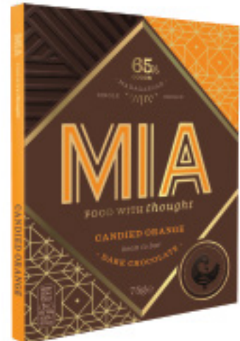
Candied Orange 65% dark chocolate M009