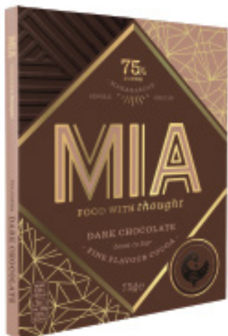
75% Dark Chocolate 75% cocoa M015