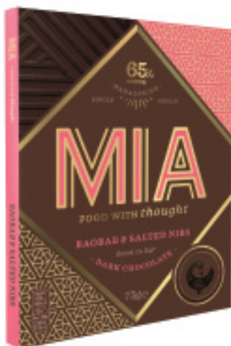
Baobab & Salted Nibs 65% dark chocolate M038

MIA is more than just our name; it's our ethos. Because we believe in making delicious chocolate fairly, everything we produce is sourced and Made in Africa.