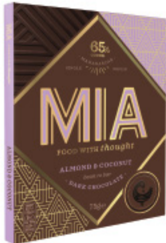
Almond & Coconut 65% dark chocolate M000

Made in Africa with fine flavor cocoa 2.65oz (75g) x10/case