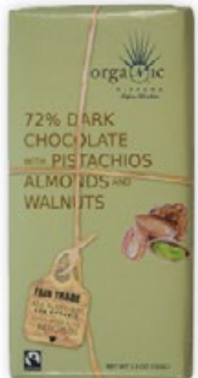
589 72% Dark Chocolate with Pistachios, Almonds and Walnuts