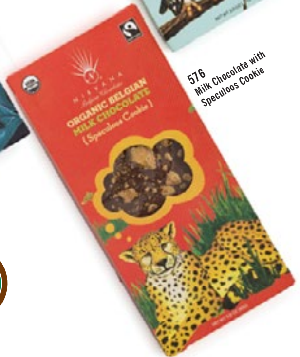
576 Milk Chocolate with Speculoos Cookie