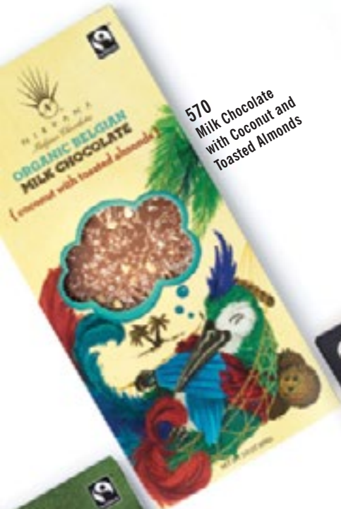
570 Milk Chocolate with Coconut and Toasted Almonds