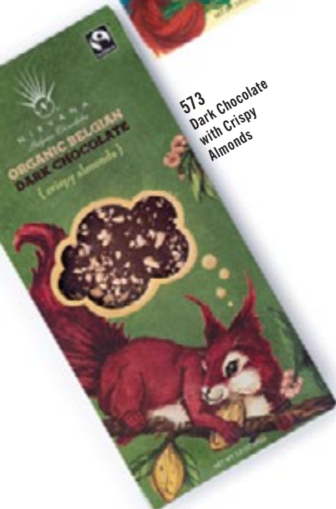
573 Dark Chocolate with Crispy Almonds