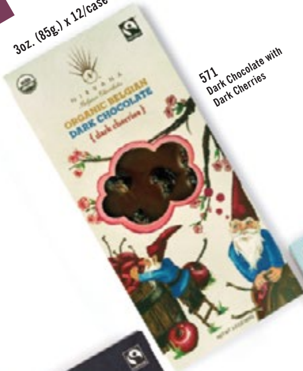
571 Dark Chocolate with Dark Cherries