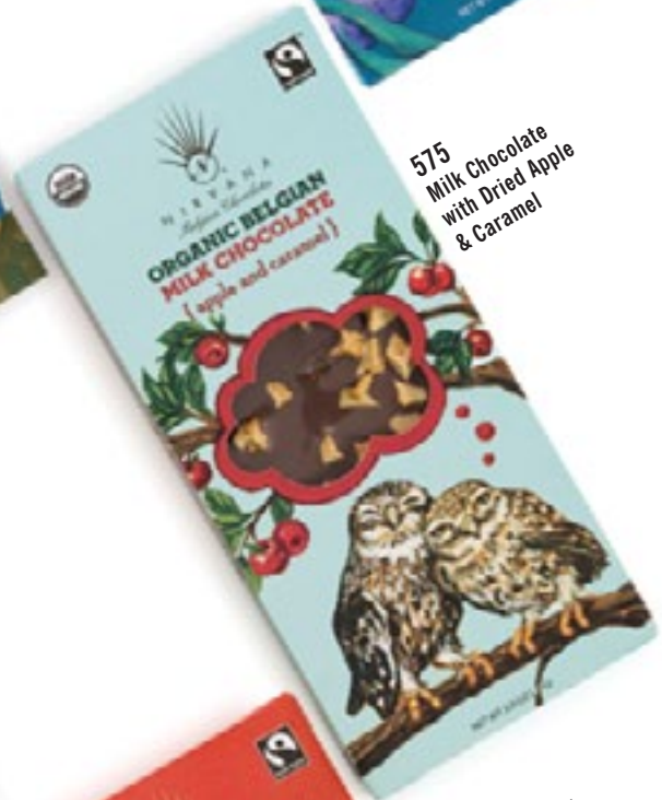
575 Milk Chocolate with Dried Apple & Caramel