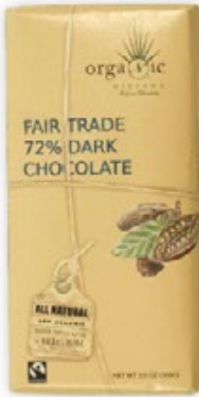
581 Fair Trade 72% Dark Chocolate