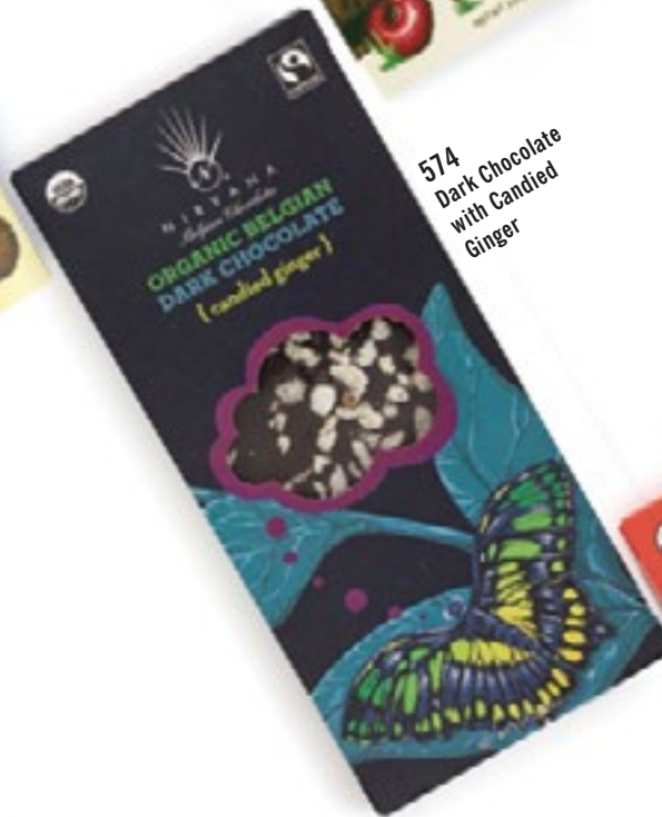
574 Dark Chocolate with Candied Ginger