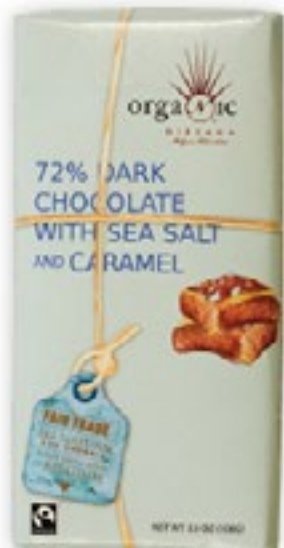
586 72% Dark Chocolate w/Sea Salt and Caramel