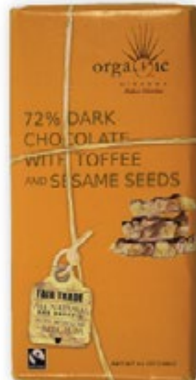
590 72% Dark Chocolate with Toffee and Sesame Seeds