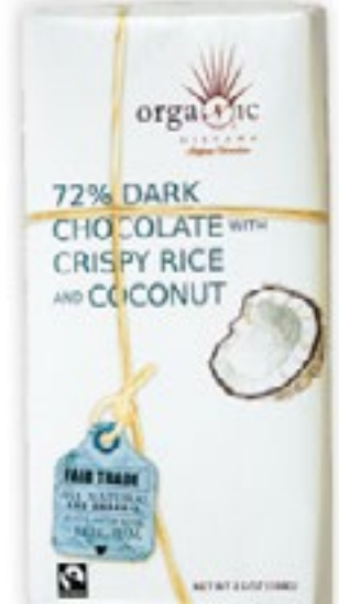
591 72% Dark Chocolate with Crispy Rice and Coconut