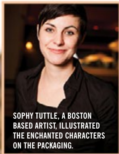
SOPHY TUTTLE, A BOSTON BASED ARTIST, ILLUSTRATED THE ENCHANTED CHARACTERS ON THE PACKAGING.

Nirvana Chocolates offers seven Organic and Fair Trade bars that showcase the Belgian chocolate with their wonderful ingredients. Each of the bars is a combination of delectably smooth Organic Milk or Dark chocolate and delightful toppings that are packaged in a see-through box adorned with beautiful illustrations. With the cocoa sourced from fair trade certified farmers, combined with popular flavor mixtures, this is indeed an enchanted series that is sure to please chocolate lovers everywhere!