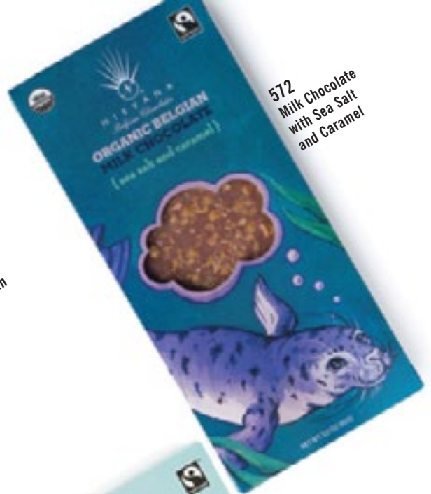
572 Milk Chocolate with Sea Salt and Caramel